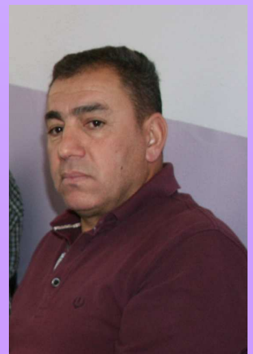
Patros E. Georges Relief & Dorms