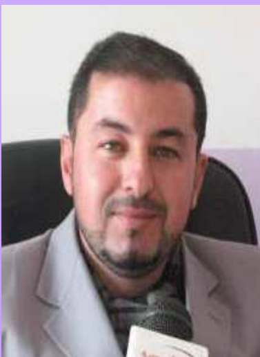
Younan L. Markhaeil Construction